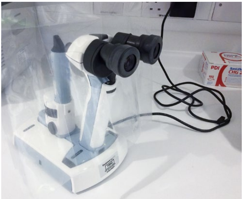
Figure 3 Portable slit lamp breath shield. UK