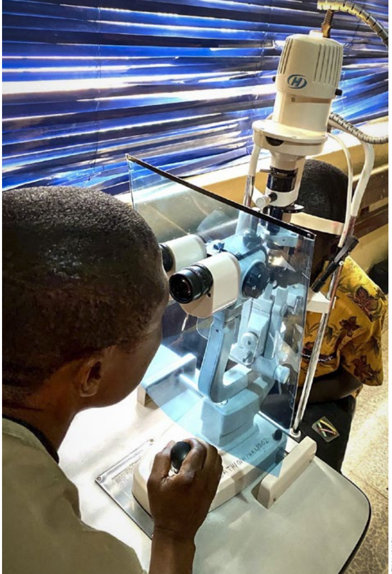
Slit lamp breath shield made from a transparent plastic folder. NIGERIA

explained at the time of making appointments or on arrival at the unit. Some accompanying persons will clearly still be needed for some situations, such as for children or those with visual impairment. Otherwise, consider keeping extra people out of the waiting area and the examination room.