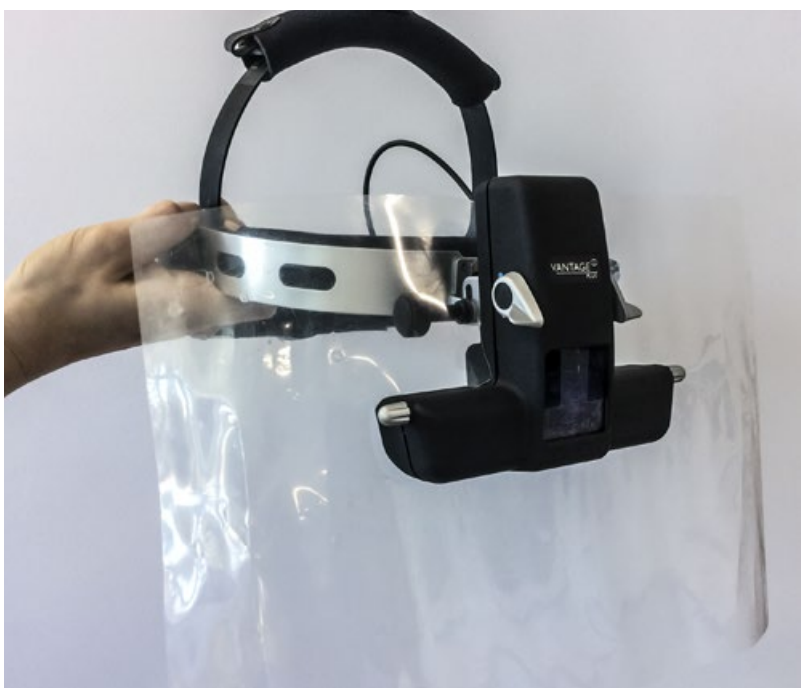
Figure 4 Indirect ophthalmoscope breath shield. UK