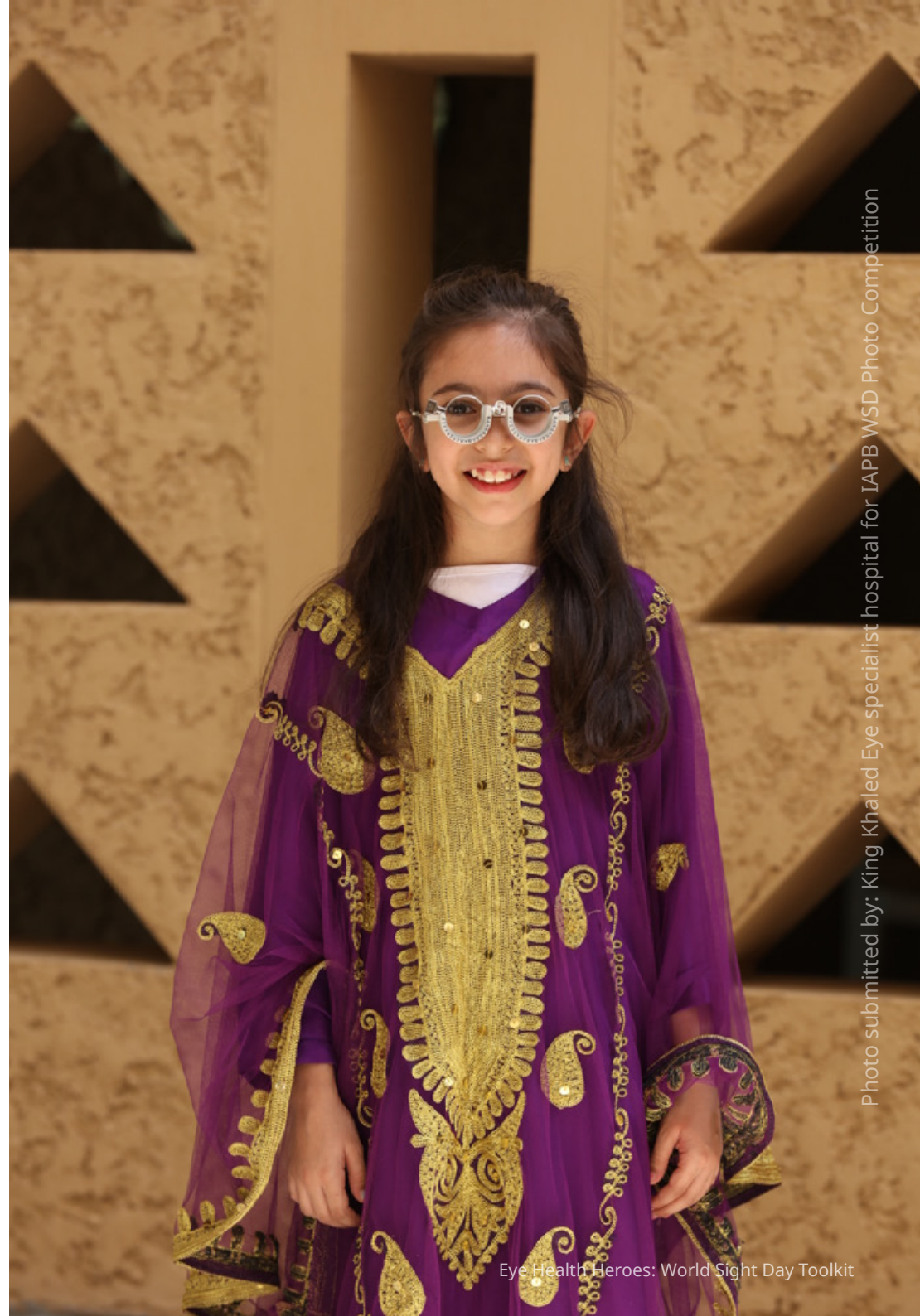
Photo submitted by: King Khaled Eye specialist hospital for IAPB WSD Photo Competition