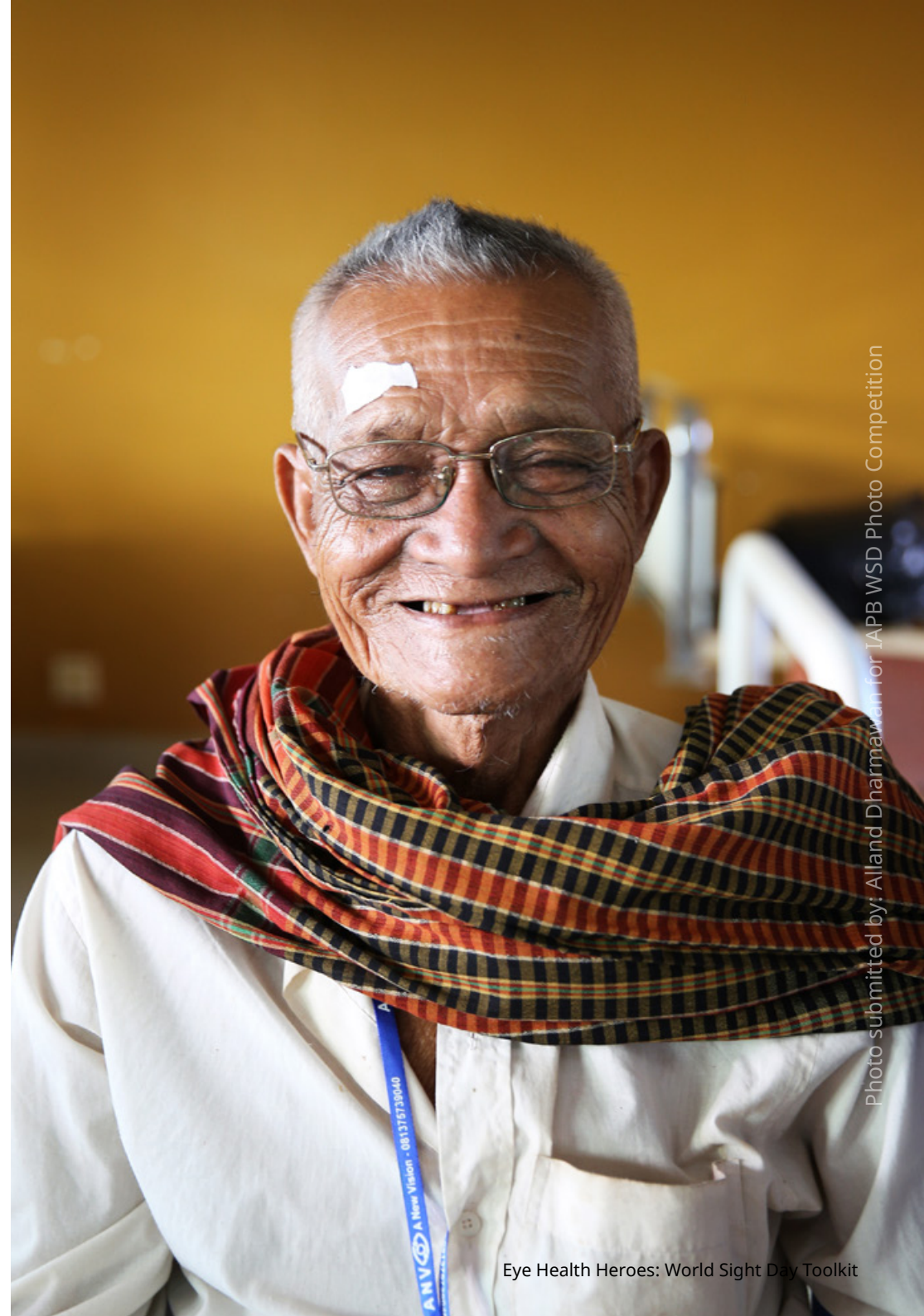
Photo submitted by: Alland Dharmawan for IAPB WSD Photo Competition