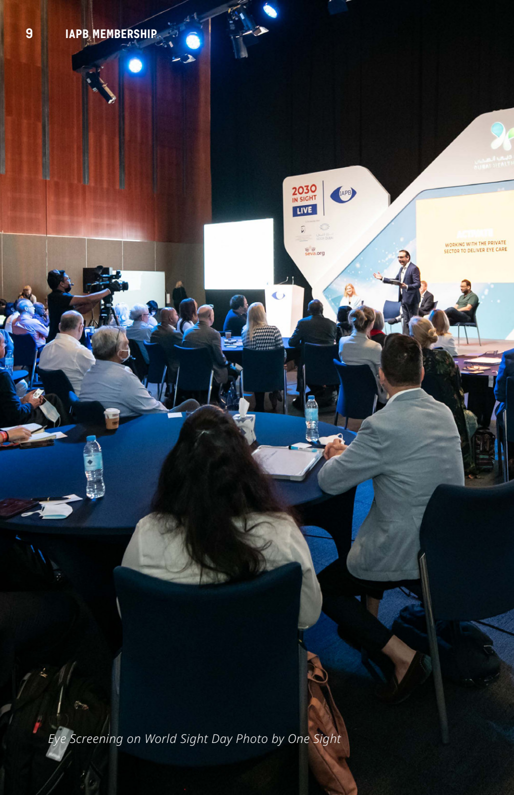
Eye Screening on World Sight Day