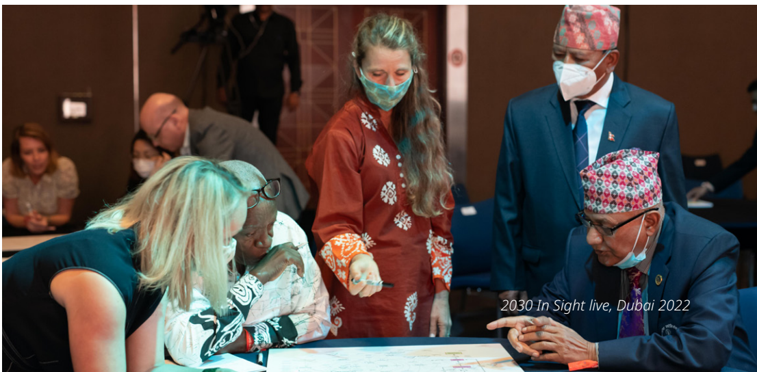
2030 In Sight live, Dubai 2022