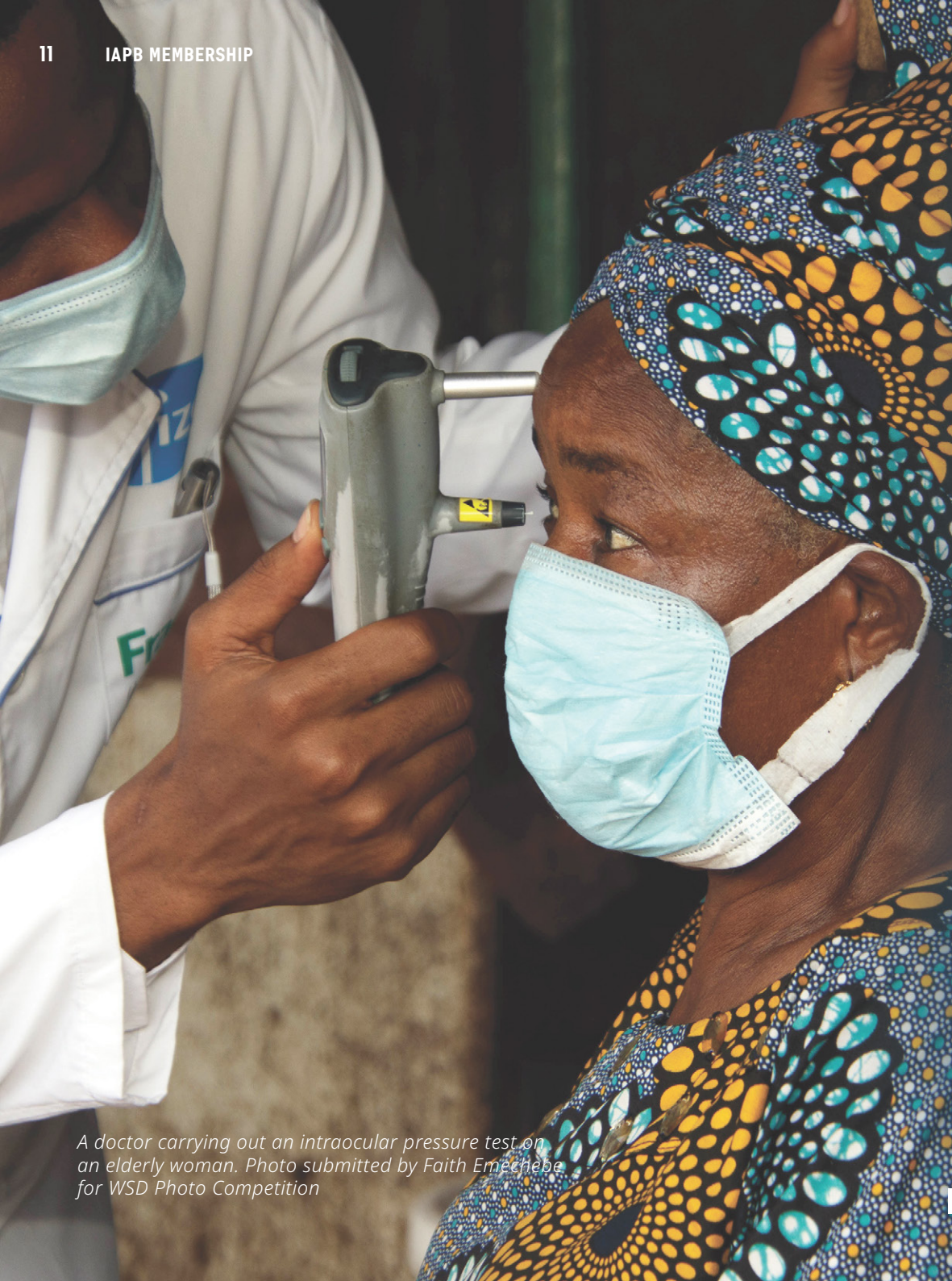
A doctor carrying out an intraocular pressure test on an elderly woman.