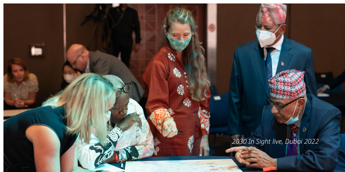
2030 In Sight live, Dubai 2022