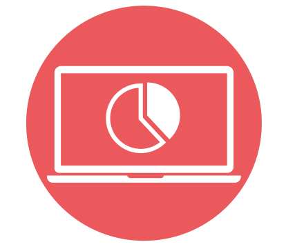
Take a break from