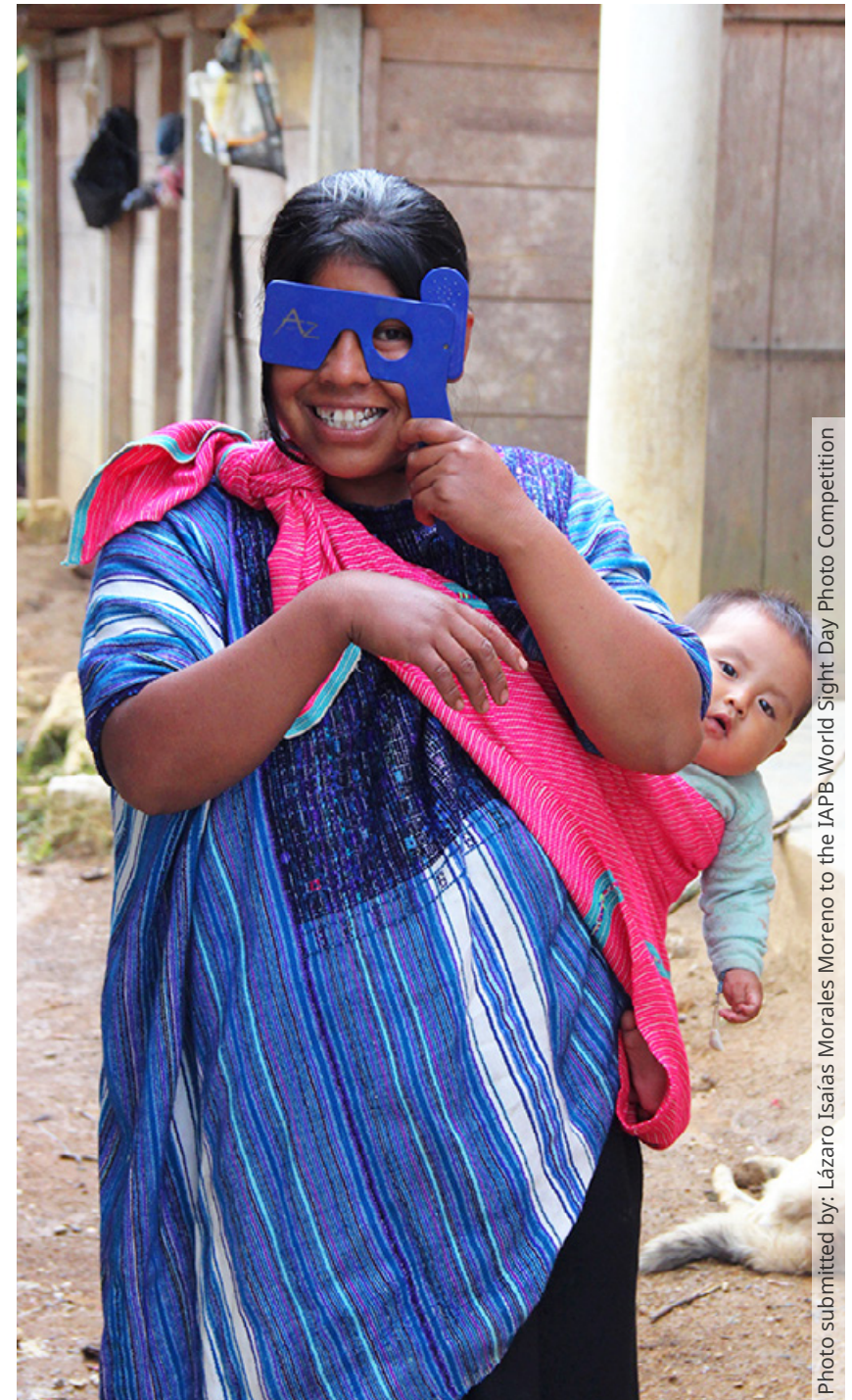
Photo submitted by: Lázaro Isaías Morales Moreno to the IAPB World Sight Day Photo Competition