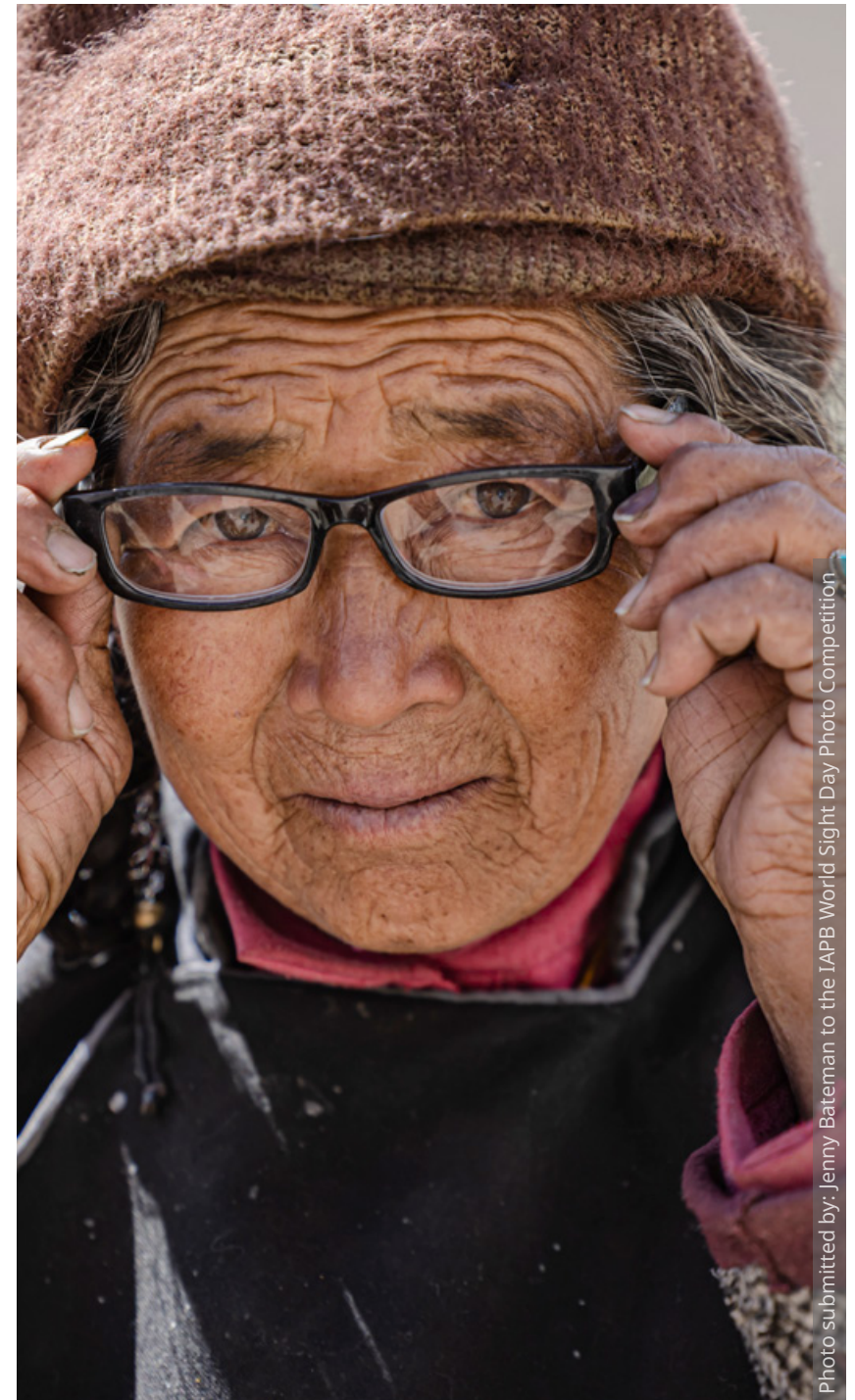
Photo submitted by: Jenny Bateman to the IAPB World Sight Day Photo Competition