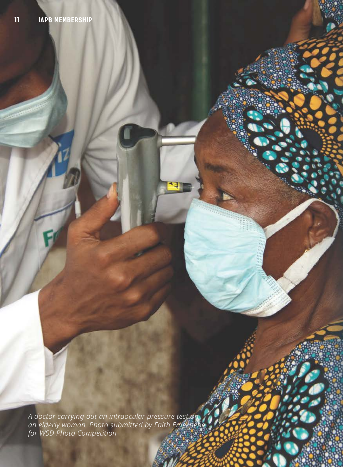
A doctor carrying out an intraocular pressure test on an elderly woman.