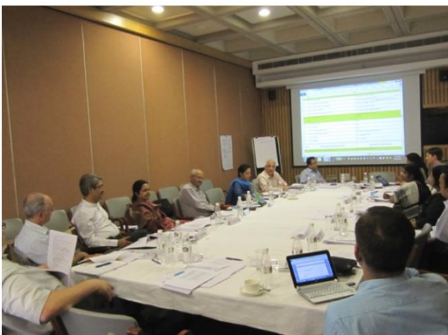
(Workshop in progress)

Facilitated by Sight Life, Seattle, the committee finalized the new Eye Bank Standards for India. This is now submitted to the Ministry of Health, Government of India, for approval.